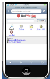
Screen shot from RefWorks-COS