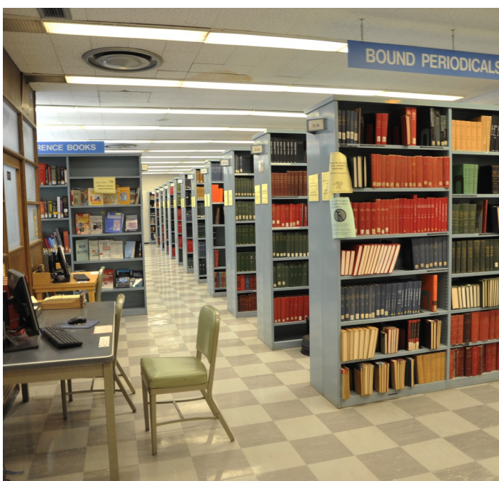
Library Entrance Before

We would like to thank the project team and stakeholders for their support and hard work throughout this project. We would also like to extend a special thank you to all past and present Dentistry Library Staff, as a renovation was in our plans for many years, and they have contributed greatly to the realisation of this project.