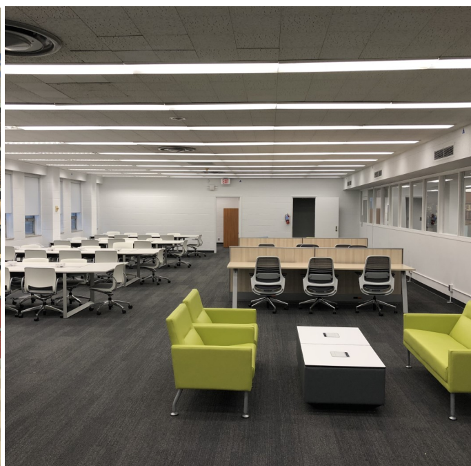
Library Entrance After

NOTE: A formal open house is scheduled at 3:30 on January 10th, stay tuned for more details.